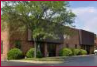
Front of Building Facing Westwood's Drive

Price Reduced! As an incentive to the purchaser who closed on or before July 1, 2011, the seller will include select office furniture in the transaction. Seller is motivated to move!