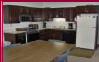
Full Size Kitchen and Break Area

Charles St. Onge, CCIM 636-451-2725 cstonge@hughes.net