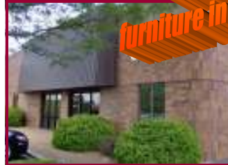
16149 Westwood's Unit