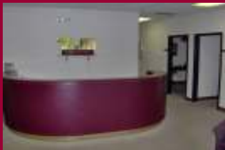
Receptionist Desk at Entry