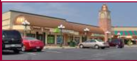
West 100 Plaza Looking Northeast