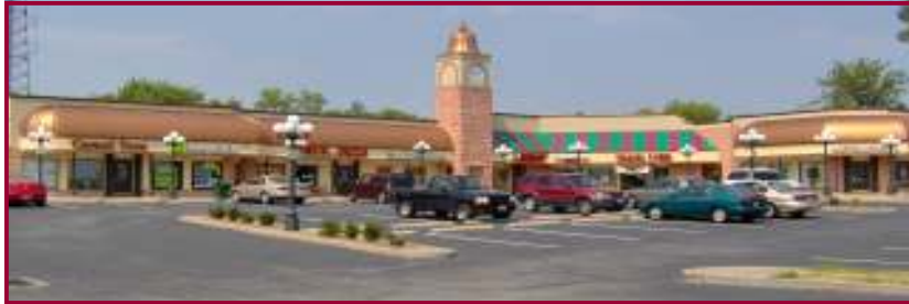
West 100 Plaza Manchester Road View