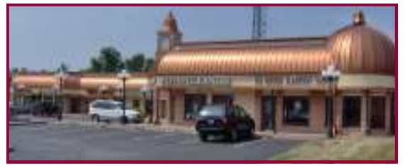
West 100 Plaza Looking Northwest