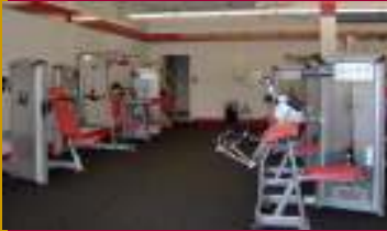
Snap Fitness Interior