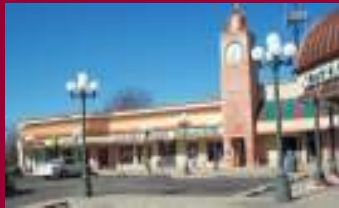
West 100 Plaza Front View