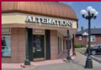
West 100 Cleaners