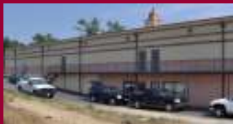
West 100 Plaza Rear Building