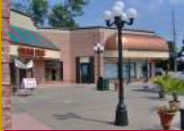
West 100 Courtyard