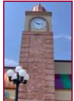
West 100 Clock Tower