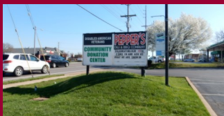
16006 Manchester Road