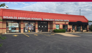
Northwest Corner at Manchester Road