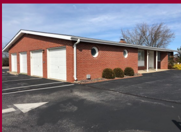
South of Building with Storage