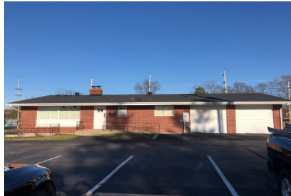
Rear Entry #54 Old State Road