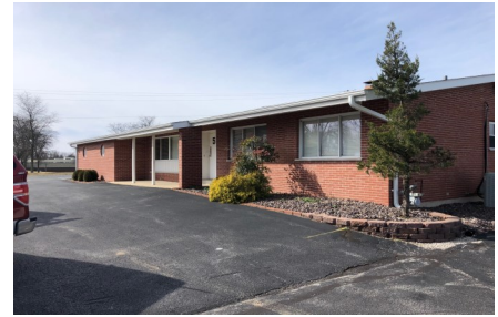
NE Corner of #54 Old State Road