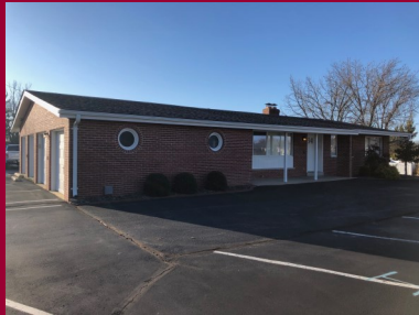
Front of #54 Old State Road